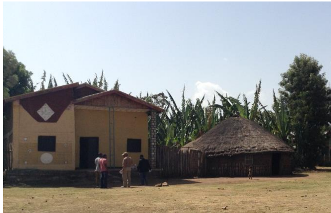
The model house (left) vs the traditional hut (right)