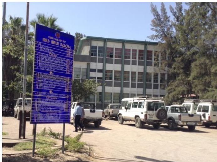
SNNP Regional Health Bureau