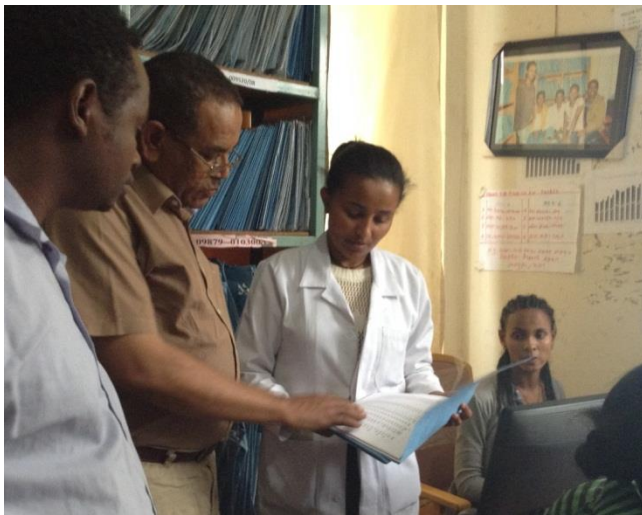
Digitizing patients' notes currently on process

The hospital received award from “Ethiopian Hospital Alliance for Quality” and received a grant amounting ETB