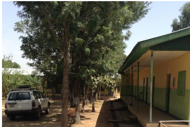
The health center – side view

Ato Gebre stated the HC makes supportive monitoring visits to the 3 health posts every month. Also, urgent issues are addressed in between the visits. Finally, he explained that the CASH system has been under implementation since the past two years using the guideline.